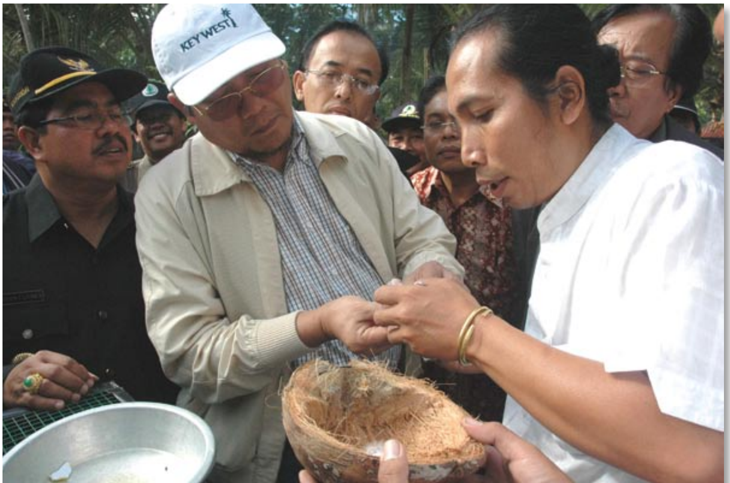
The Indonesian Minister for Forests, M.S. Kaban (pictured left) handles a highly threatened Bali Starling chick on Nusa Penida, an island off Bali.

Nations appear generally in favour of including "avoided deforestation" in any post-Kyoto agreement.