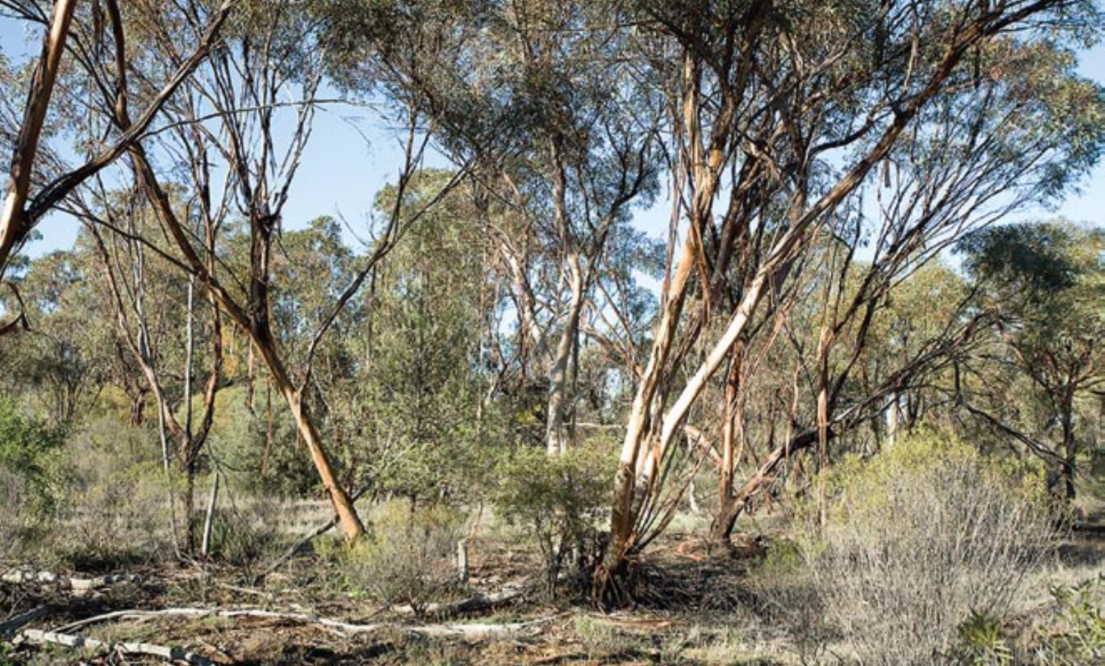
Bull Mallee – White Mallee tall mallee woodland on red sand loam soils in the central western slopes of NSW

The Wildlife Land Trust is an important component of HSI's overall habitat protection activities, and we will bring you news in future WLT newsletters of our overall campaign efforts. As an example of our work, HSI submitted a scientific nomination to see the protection in New South Wales of a highly threatened mallee woodland community.